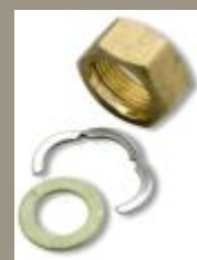
female thread with c clip & gasket

Now place a "C" clip behind the flange. This ensures that the brass union nut does not damage the flange on tightening.