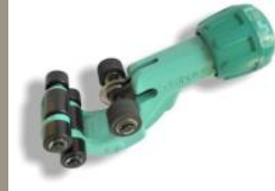
Inta Inox pipe cutter

Place the nut on the pipe and then clamp the bar leaving 3 ridges of pipe above the jaws.