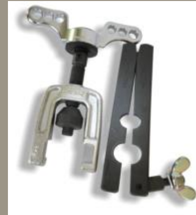
Inta Inox flanging tool

Compress the pipe by winding down the handwheel. Use the ratchet action to tighten until flat. The flange is now formed.