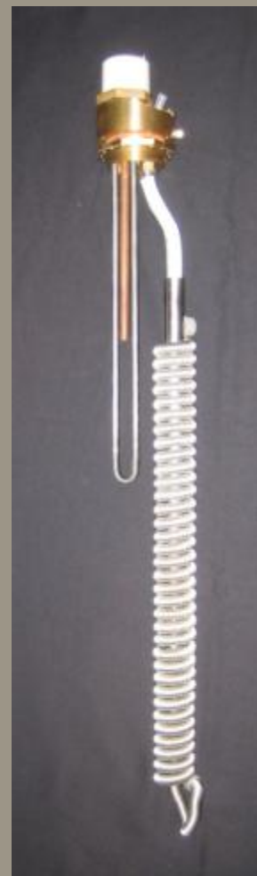
solarvert conversion heat exchanger

Make sure the existing cylinder is fit for purpose. There must be no obvious signs of leaks or corrosion, & the tank must be well insulated. For tanks without the BS1566:1-2002 sticker, an additional insulating jacket made to BS5615:1985 must be fitted.