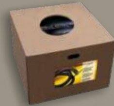
Coils supplied in boxes