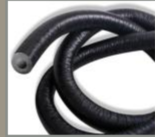
Solar k-fles pipe insulation