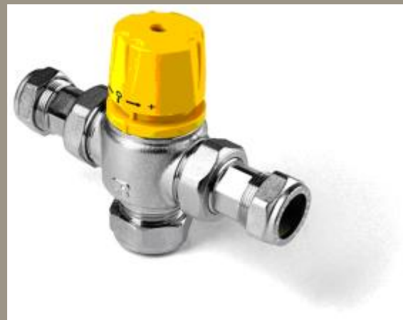
Low pressure solar thermostatic mixing valve

6 In a situation where one or both of the water supplies are excessive, it is possible to fit a pressure reducing valve to reduce the pressure(s) to within the limits quoted previously.