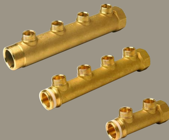
general distribution manifolds

Max working pressure: 10 bar Working temperature range: -10°C - 110°C Outlet centre distance: 1" = 50mm 1¼" = 60mm