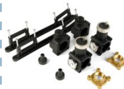
a typical component kit KIT00255003